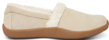
Smooth Toe Sand