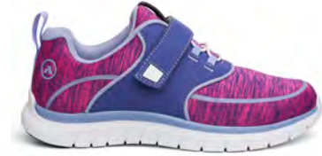
Sport Jogger Purple/Pink