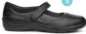
Casual Mary Jane Black