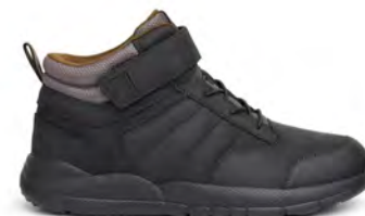
Trail Boot Oil Black