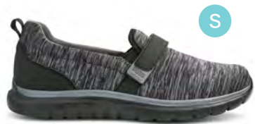
Sport Trainer Black/Grey