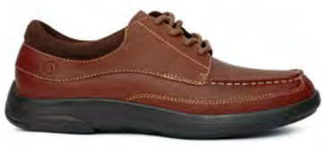
Casual Dress Whiskey