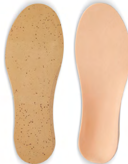
Custom Cork Inserts A5514 Reviewed