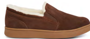
Smooth Toe Espresso