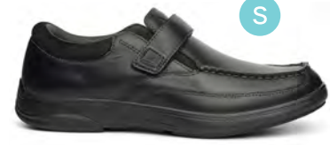
Casual Dress Black