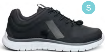
Sport Runner Black/Grey