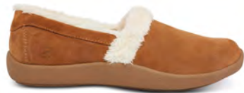
Smooth Toe Camel