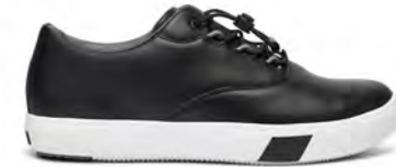
Casual Sneaker Black