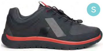
Sport Runner Black/Red