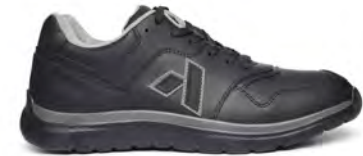
Sport Trainer Black