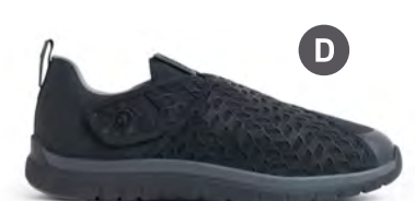
Sport Double-Depth Stretch Black