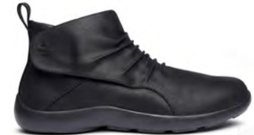
Casual Boot Black