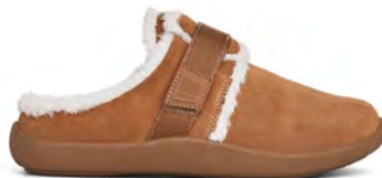
Open Back Camel