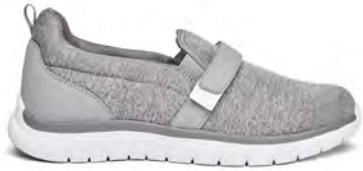
Sport Trainer Grey