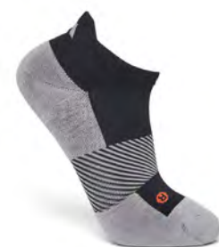
No Show Black