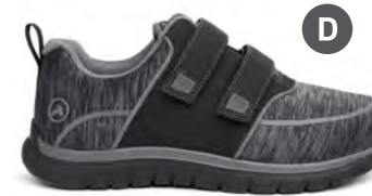
Sport Double Depth Black/Grey