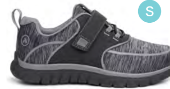
Sport Jogger Black/Grey