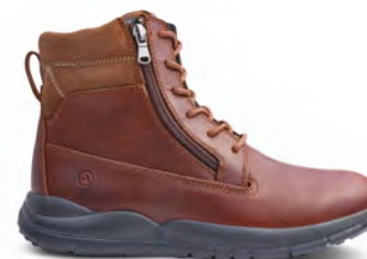
Trail Worker Whiskey