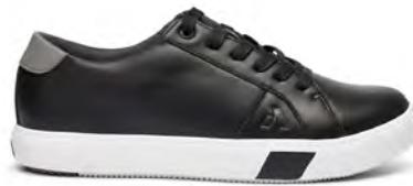
Casual Sneaker Black