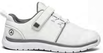
Sport Jogger White/Grey