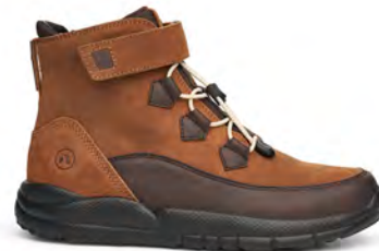
Trail Hiker Almond