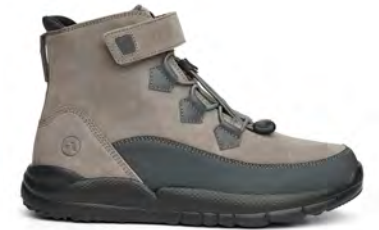
Trail Hiker Grey

The comfort you deserve. The style you desire. The support you require.