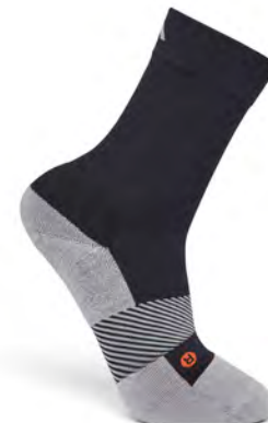
Crew Length Black