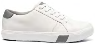
Casual Sneaker White