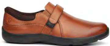
Casual Dress Cognac