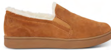
Smooth Toe Camel