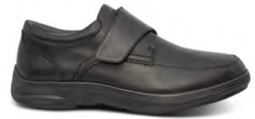
Casual Oxford Black