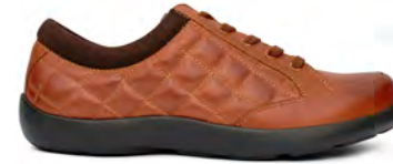
Casual Sport Saddle