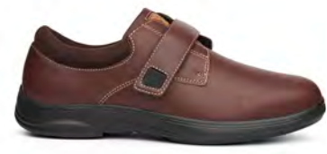
Casual Comfort Whiskey