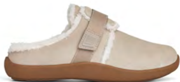
Open Back Sand