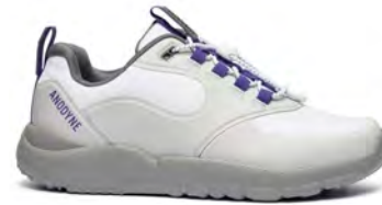
Trail Runner White