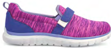
Sport Trainer Purple/Pink