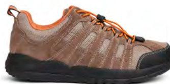
Trail Walker Stone