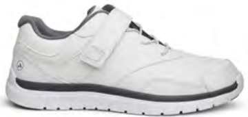
Sport Walker White