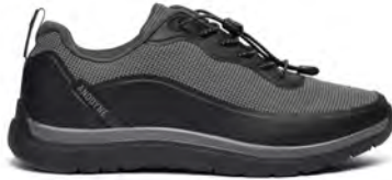
Sport Sprinter Black