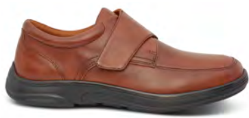
Casual Oxford Burnished Brown