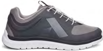
Sport Runner Grey/Black