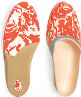
Partial Foot Toe Filler L5000 Reviewed