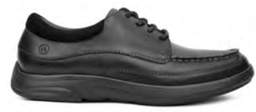
Casual Dress Black