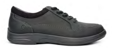
Casual Sport Oil Black