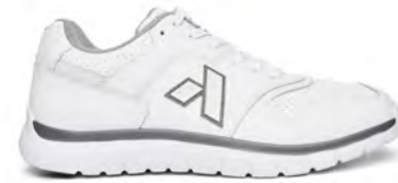
Sport Trainer White