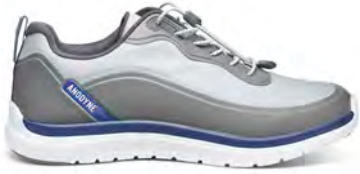
Sport Sprinter Grey