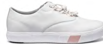
Casual Sneaker White