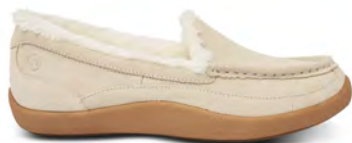
Moc Toe Sand