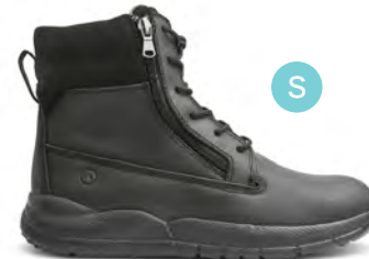
Trail Worker Oil Black