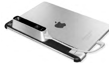
3D | iPad 3D Camera Anodyne App

Working with a team of industry experts, we've developed an ultraportable, easy-to-use, and affordable 3D scanner. With accuracy within +/- .5 mm, there is no longer a need for impression foam boxes or plaster casts. Orders can be sent and received within minutes, eliminating shipping charges and reducing lead times. Our scanning software is offered to all Anodyne suppliers free of charge (no fees or click charges).