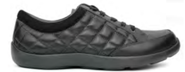
Casual Sport Black