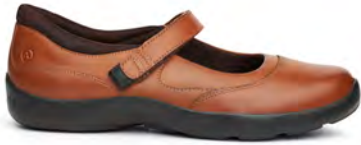
Casual Mary Jane Cognac