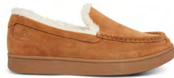
Moc Toe Camel