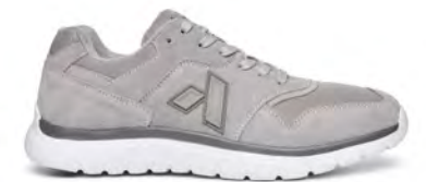
Sport Trainer Grey