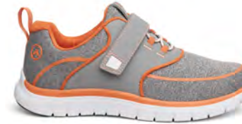
Sport Jogger Grey/Orange