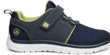
Sport Jogger Blue/Green