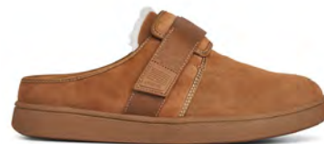
Open Back Camel