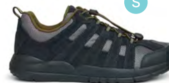
Trail Walker Dark Grey