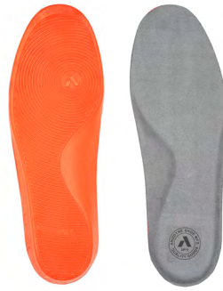
Gel-Foam Hybrid Inserts