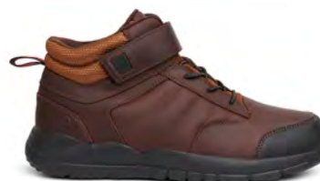
Trail Boot Whiskey