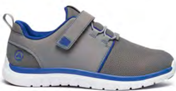
Sport Jogger Grey/Blue