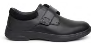
Casual Comfort Stretch Black Stretch