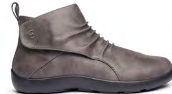
Casual Boot Grey