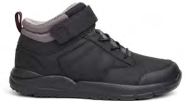
Trail Boot Oil Black