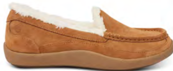
Moc Toe Camel