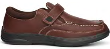
Casual Dress Whiskey