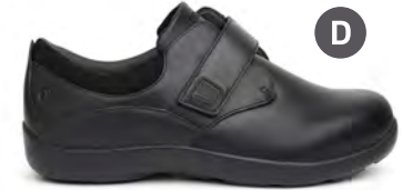
Casual Double Depth Black Stretch