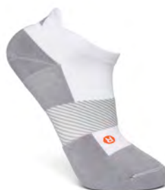
No Show White