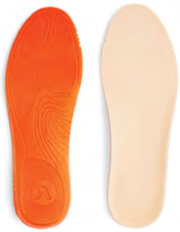
Tri-Lam Heat Moldable Inserts A5512 Reviewed