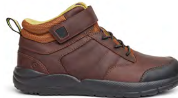
Trail Boot Whiskey