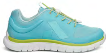
Sport Runner Teal/Lime