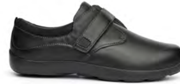
Casual Comfort Black