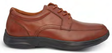
Casual Oxford Burnished Brown