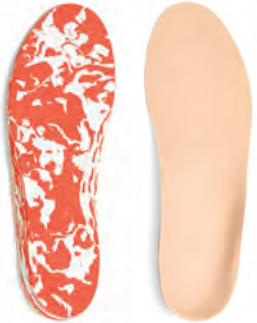
Custom Accommodative Inserts A5514 Reviewed