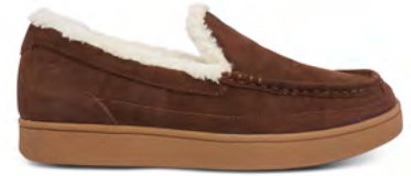
Moc Toe Espresso