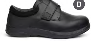
Casual Double Depth Black Stretch