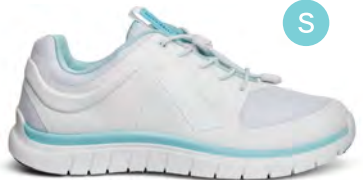
Sport Runner White/Blue