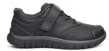
Sport Walker Black