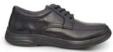
Casual Oxford Black