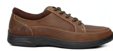
Casual Sport Oil Brown