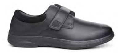
Casual Comfort Black