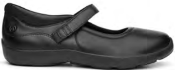
Casual Mary Jane Stretch Black Stretch