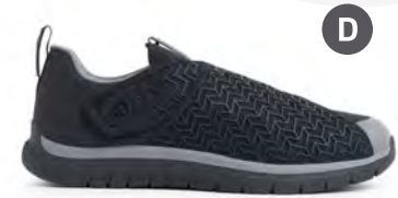
Sport Double-Depth Stretch Black