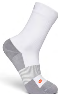
Crew Length White