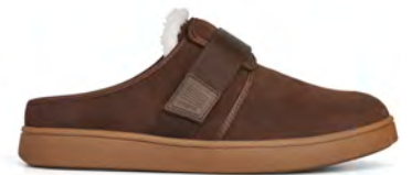
Open Back Espresso