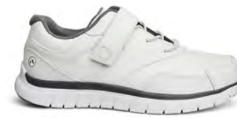
Sport Walker White