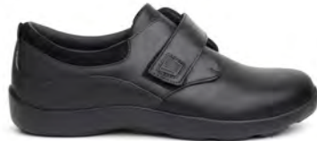
Casual Comfort Stretch Black Stretch