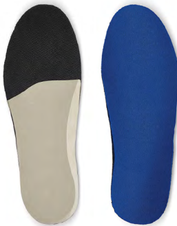
Semi-rigid Orthotics L3010/3020 Reviewed