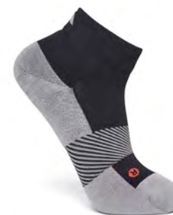
Quarter Length Black