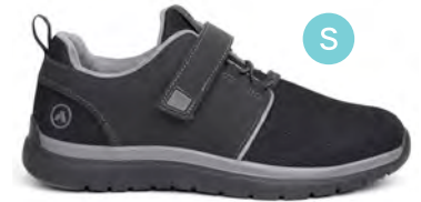
Sport Jogger Black/Grey