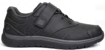
Sport Walker Black