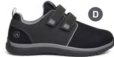
Sport Double Depth Black/Grey