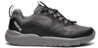
Trail Runner Black