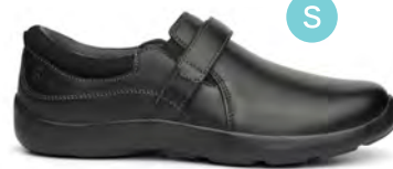
Casual Dress Black