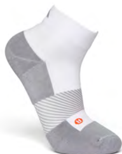
Quarter Length White